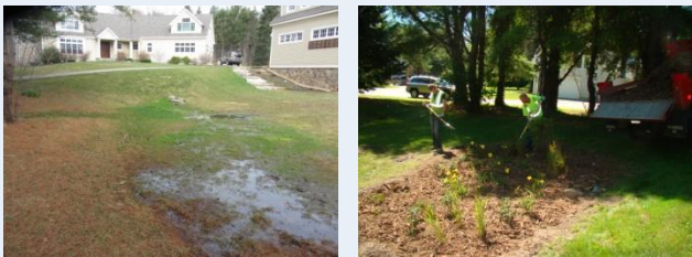
Before and after photos from a Rain Garden Installed on Geremia Street