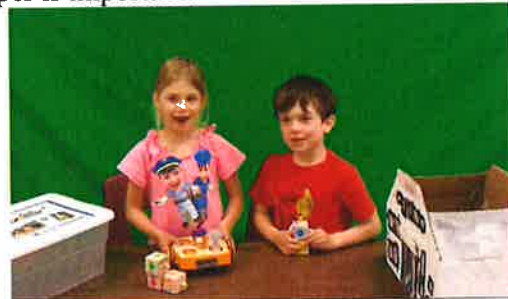
POLICE STATION & OFFICERS

First Grade: Protecting the Estuaries-Students learned about estuaries and the importance of protecting this unique ecosystem. They generated ideas and took action to inform the community of the need to protect Rye's estuaries. Still in process so no photos.