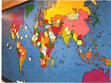
Mapping out the Habitat Locations