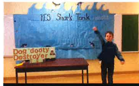
Dog Dooty Destroyer

Fifth Grade: Science Fair-Students identified a question of their choice and followed the scientific method to find the answer.