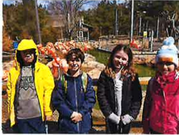
Stone Zoo Scientists

Third Grade: Designing a Zoo Habitat- The students researched an animal and what they need for a healthy habitat. They visited the Stone Zoo to compare the habitat to what they researched. They followed up with a letter to the Zookeeper explaining what changes they believe the zoo should make to create a healthier habitat if necessary.