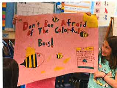
Poster Informing Public of Painted Bees