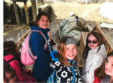
Checking out a Habit

Fourth Grade: Shark Tank- Students worked in collaborative groups to identify and create a solution to an everyday problem. Some projects included: Magnetic trash bags that will not fall in a trashcan, Puppy Go-everything you need to travel with a puppy, and two pictures featured below.