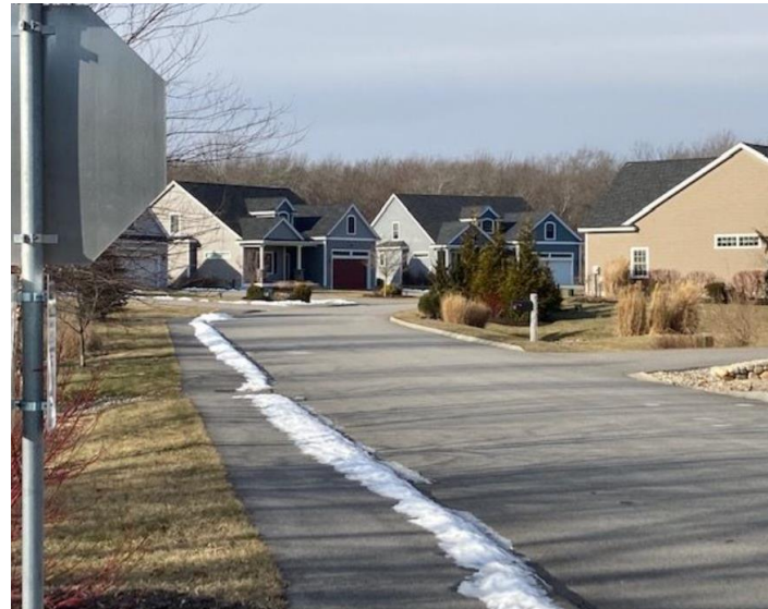
1244 Washington Rd