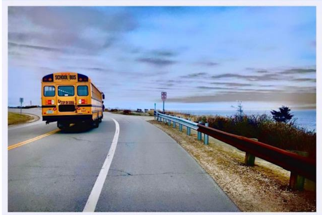
*Rye Resident Stew Berman snapped this picture of a bus along the ocean.