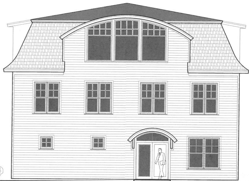
OFFICE BUILDING WEST ELEVATION (facing Sagamore Ave)

OWNERS ADDRESS: ED BENWAY 303 ISLINGTON STREET PORTSMOUTH, NH 03801