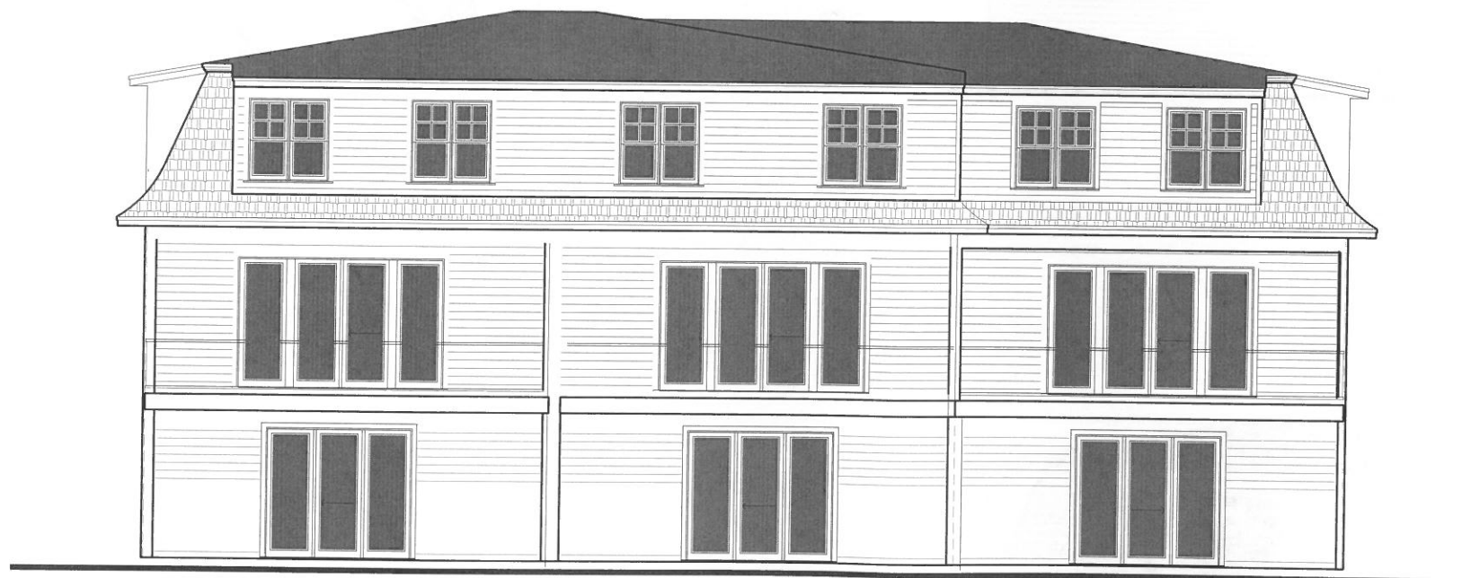
EAST ELEVATION (facing woods)