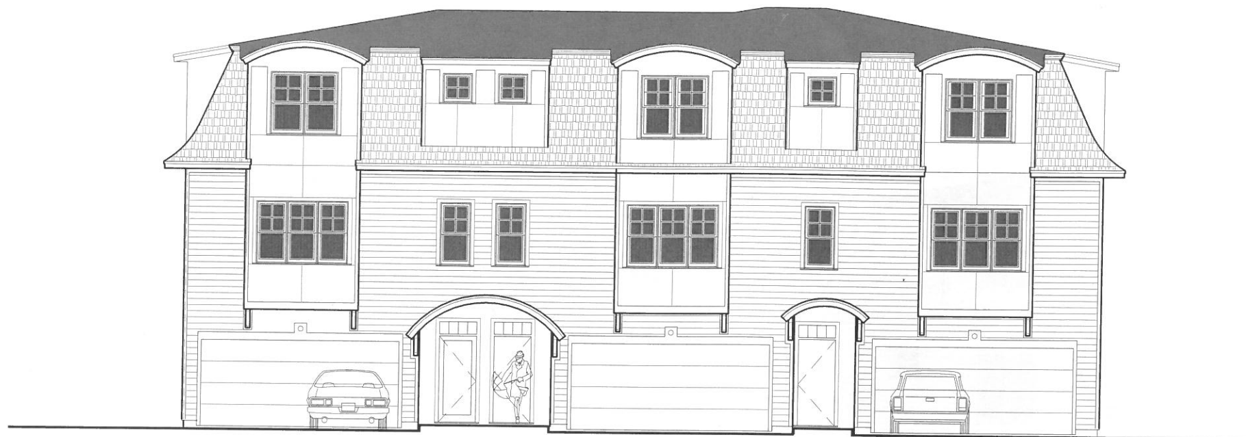
WEST ELEVATION (facing Sagamore Ave)