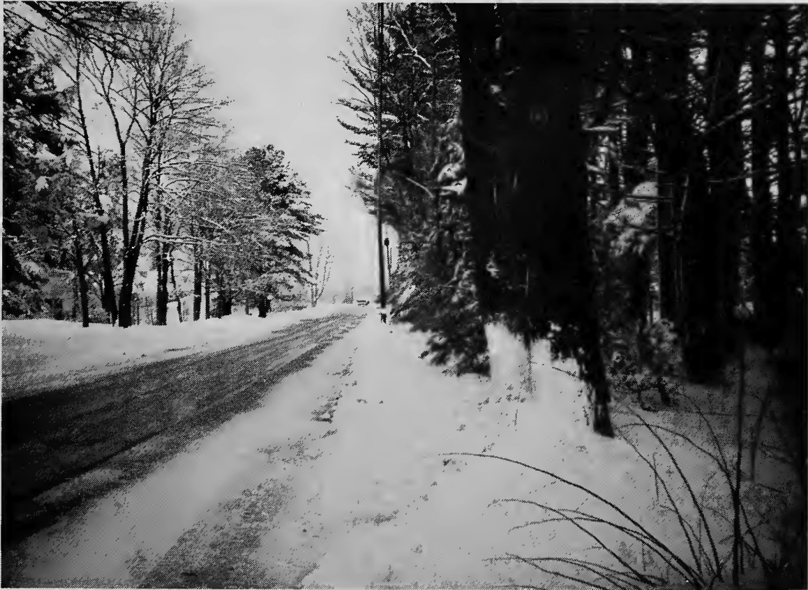
Long John Road